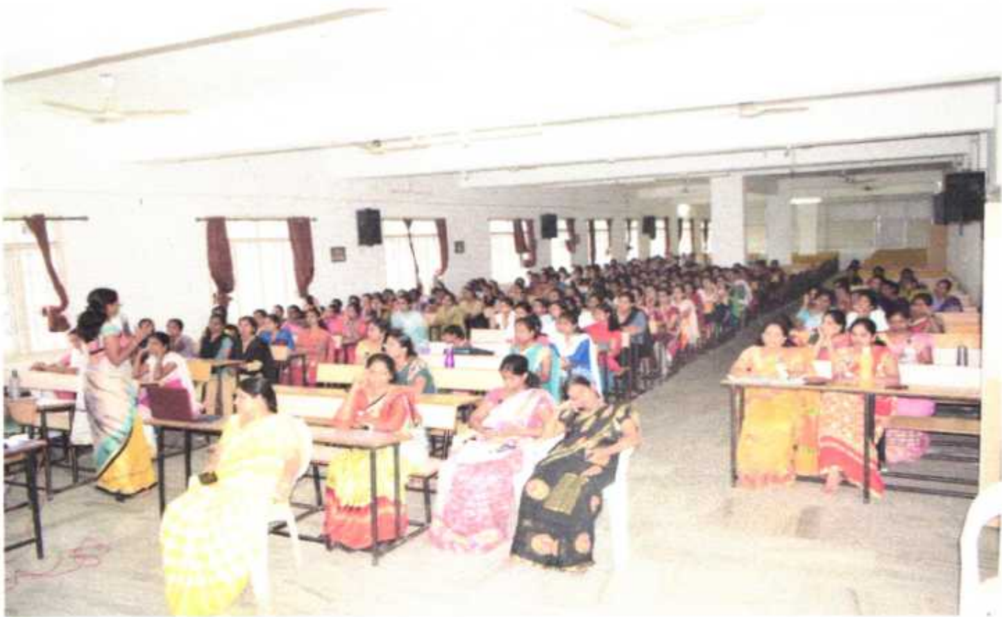
Figure 3: From left NSS coordinator ,faculties and students

e-mail : narayana_nursing@yahoo.co.in website : www.narayanannursingcollege.com