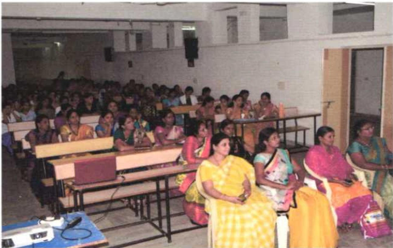
Figure 4: Faculties and students on personality development programme

e-mail : narayana_nursing@yahoo.co.in website : www.narayanannursingcollege.com